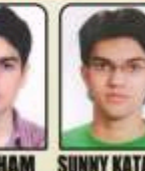
SHUBHAM IIT: 426