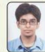
RAHUL GANDHI JEE: 972* / IP: 1632