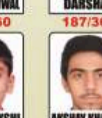
SHUBHAM IIT-JEE: 3482